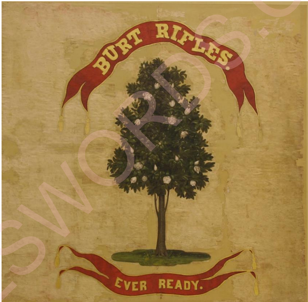
Flag of the 18th Regiment, Mississippi Infantry (Burt Rifles)