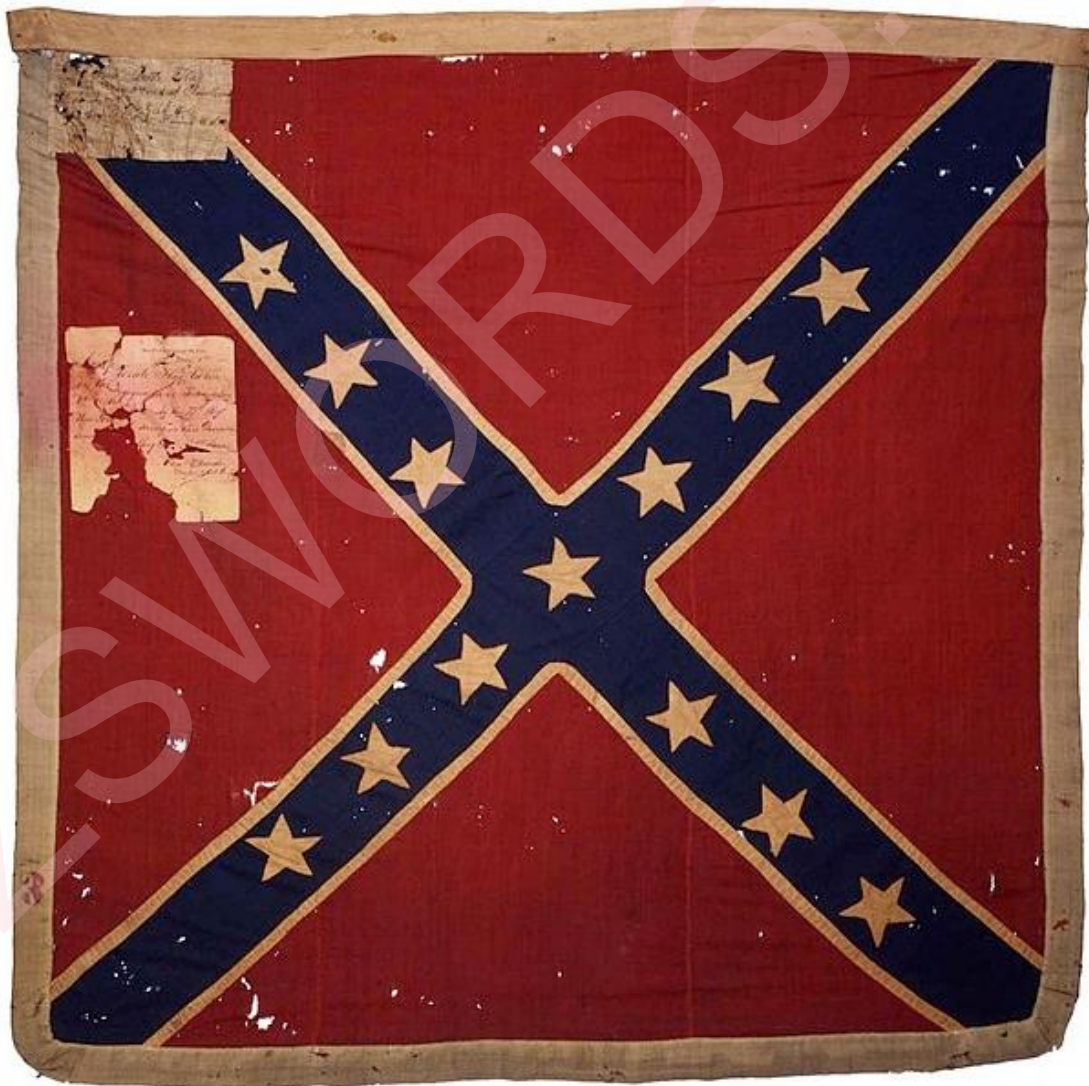
Flag of the 18th Mississippi Infantry