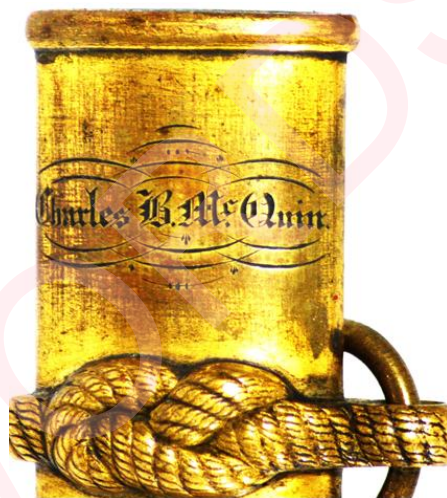
Charles B. McGuin

It is an Ames Model 1852 Naval Officers sword. The hilt is tight with much original gold wash; the white grip shows wear, but has 100% original twisted wire; the original blade washer holds the frosty etched blade tight; and the scabbard is complete with all its original mounts and screws. On the top mount is etched the name: Charles B. McGuin.